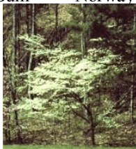
White Flowering Dogwood

Shade Trees: 1" caliper will be approximately 6-8' in height at planting. 2" caliper will be approximately 9'+ in height.