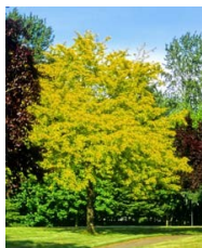
Thornless Honey Locust